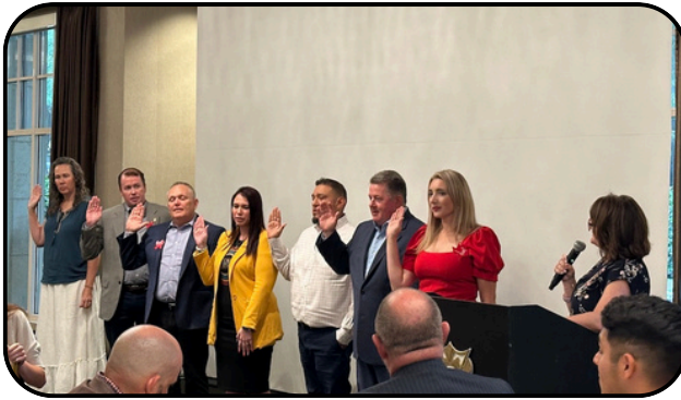
Swearing in the new Chapter 36 officers

Many exciting things happened during the June meeting, such as the announcing of the Donnie Sherwood Scholarship Winners, announcing the Greg Cook Winners, and installing the 2025-2026 Chapter 36 officers.